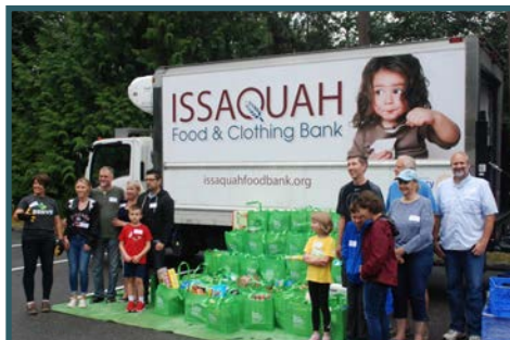
Issaquah-Sammamish Food Project volunteers.

Our local Mobile Integrated Healthcare program is scheduled to roll out in early 2020. We are looking forward to starting the new year off with important new partnerships, helping us provide more of our essential services!