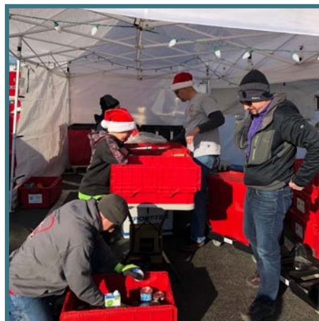
Eastside firefighters and volunteers loading totes to "Fill the Truck"!

Thanks to the contributions of hundreds of donors and the tireless efforts of 120+ volunteers and, of course, our Eastside firefighters and staff, we received 32,712 lbs. of food, 5 pallets of new toys and clothing, and over $3,400 in financial gifts.